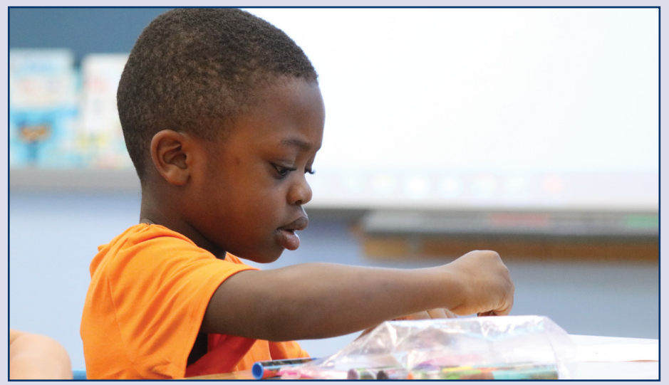
Incoming kindergarten students got a jump-start on school, meeting teachers and friends, and working on reading, writing and math.