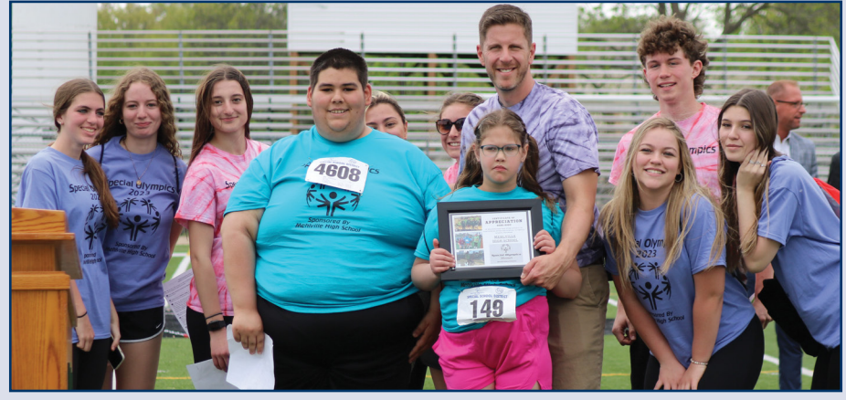
Mehlville High School students planned and hosted Special Olympics in the spring.

Oakville High School is also a National School of Character, receiving the recognition in 2020. Mehlville School District was recognized as a National District of Character in 2019.