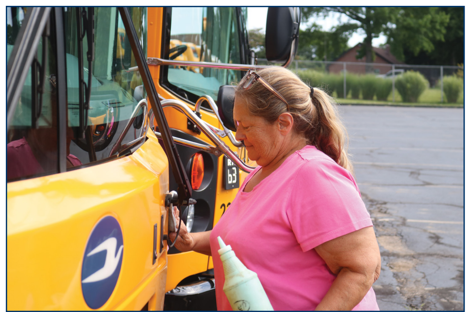
Transportation staff deep cleaned and prepared buses for the new school year.