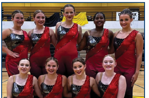
Mehlville High School Majorettes