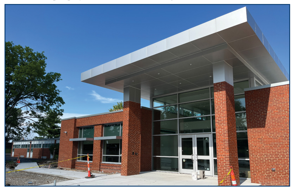
Bierbaum Elementary School has a new secure entrance, reconfigured office space, accessible classrooms and a safer front parking lot configuration. Crews have started work on more classrooms, an expanded library and storm shelter.

Work on Prop S projects will continue through 2025.