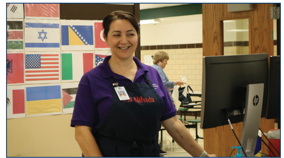
Our School Food and Nutrition Services staff look forward to serving healthy meals to students each day.

Mehlville School District participates in the National School Lunch and Breakfast Programs, which allows eligible families to receive free and reduced meal benefits. See page 10 for details.