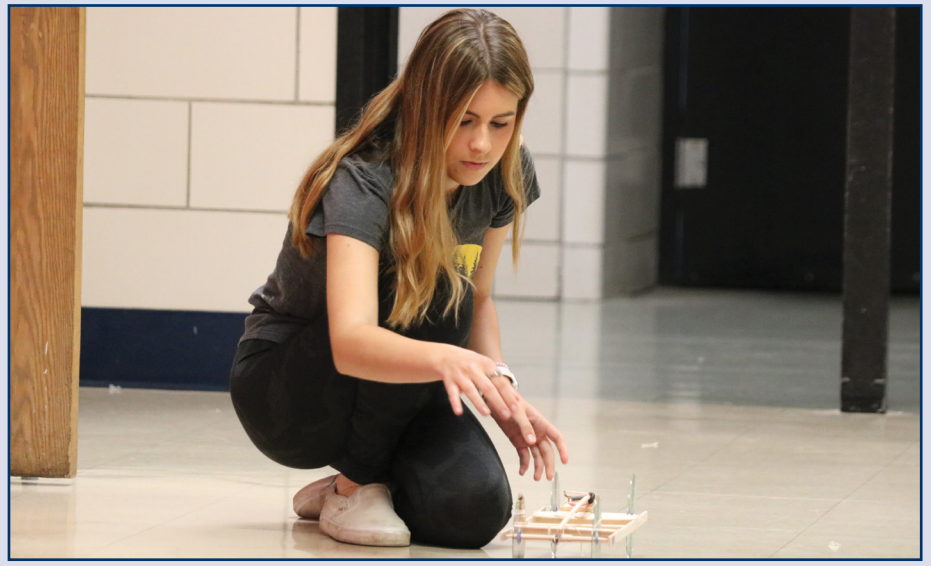
Students at Oakville Middle School's Summer Session constructed mouse trap cars and tested them to see whose could go the farthest. The winning group's car traveled more than 62 feet.

on learning in math, science, English language arts, social studies, physical education and the arts. High school students completed upwards of 800 courses in either the on-campus or virtual summer program.