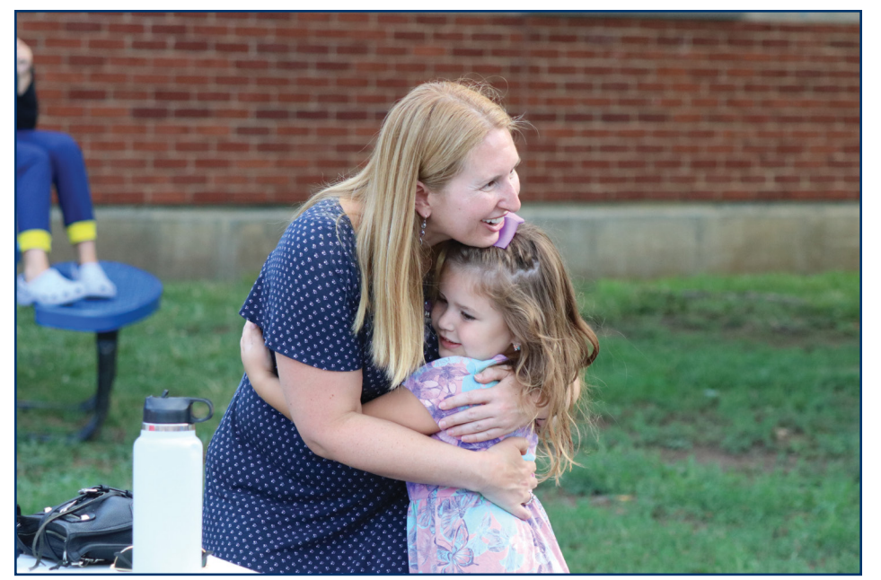
Students have the opportunity to meet staff and explore their schools this summer.