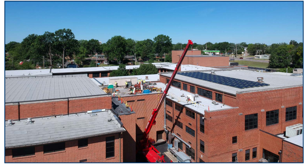
Crews replaced a portion of the roof at Mehlville High School this summer. See more facilities work on page 4.