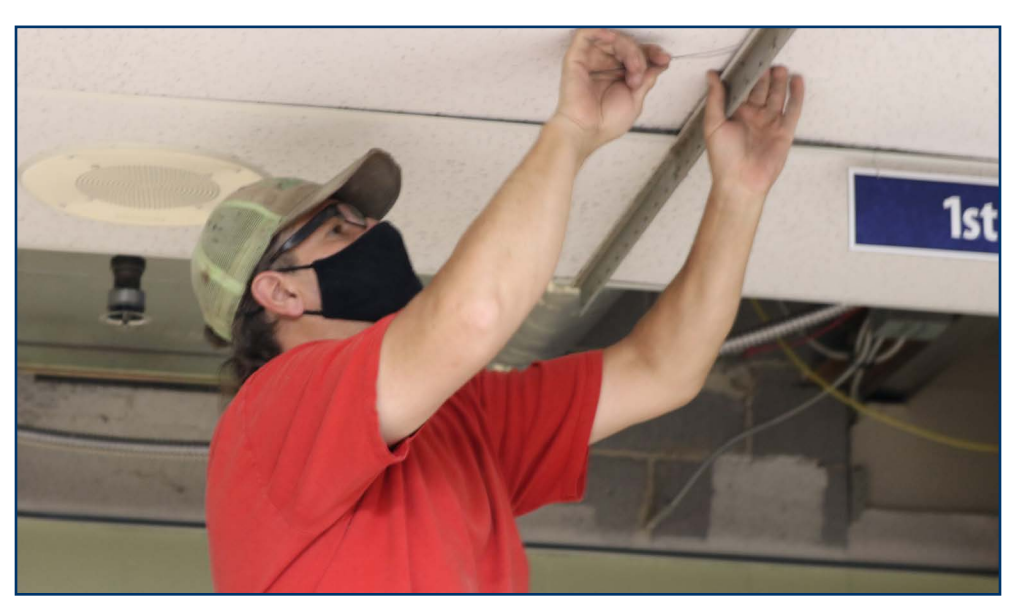
Forder Elementary underwent a complete HVAC renovation this summer.

This project was paid for using Prop S funding. John Cary Early Childhood Center, Beasley Elementary School, Rogers Elementary School and Mehlville High School are all slated for future HVAC replacement using Prop S funds.