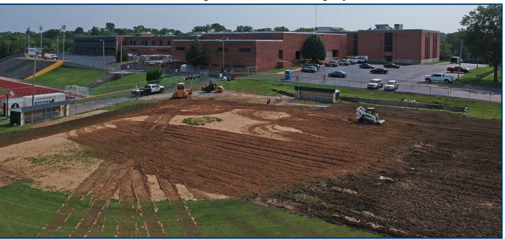
Crews are expected to complete extensive safety improvements to the Oakville High School baseball/softball field near the end of October.

The project is being paid for using funds generated by Prop S. The baseball/softball fields at Mehlville High School are scheduled for similar safety upgrades through Prop S. That project is a larger project since the baseball field will be relocated due to a storm drain in the outfield. Due to the high price of construction materials, there are plans to rebid that project for next summer.