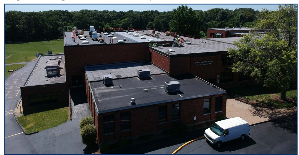
Crews replaced 357 roof squares at Oakville Middle School.

Bierbaum Elementary, Trautwein Elementary, Bernard Middle, Buerkle Middle, Oakville Middle, Washington Middle and Oakville High are all scheduled to have portions of their roof replaced using funds generated from Prop A and Prop S within the next five years.