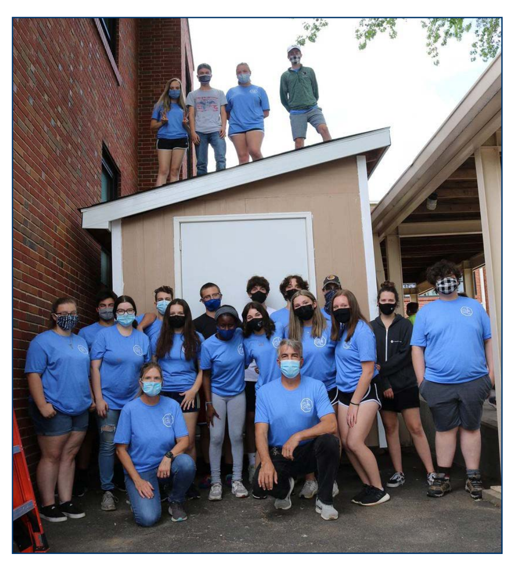
Above: Mehlville High School Geometry in Construction students with their completed shed at MOSAIC Elementary School.

Students at Mehlville High School and Oakville High School can enroll in Geometry in Construction any year of high school after completing Algebra I.